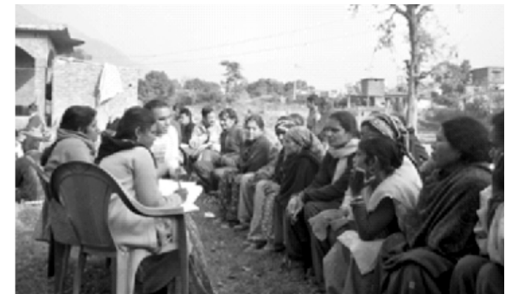
The village study visit for the participants of the CDM course

intervention in the villages. The BDO and other Uttarakhand officials were also invited as observers during the presentation of the group reports.