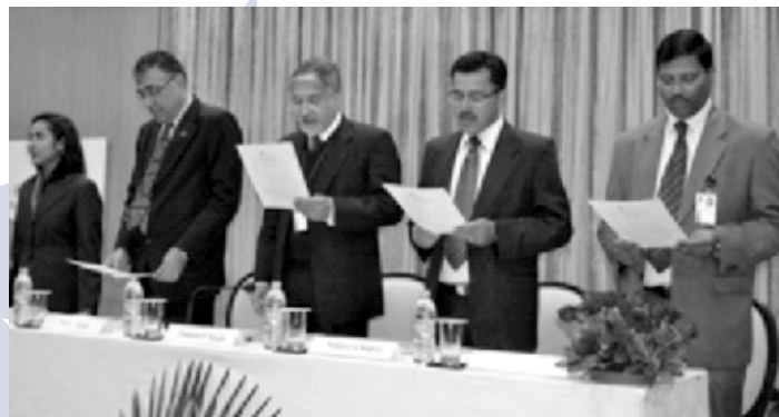
↑ Inauguration ceremony - at the Academy for Phase V ↓

as well as Strategic Leadership and Ethics. The global perspective was followed up by inward focus and deliberations on issues of strategic importance for the nation. In the Academy, the first two weeks, from 21 December have been scheduled for sessions by the Indian Institute of Management (IIM), Ahmedabad and primarily included inputs on infrastructure - social and physical, regulatory frameworks, subsidies, financial sector and related reforms. A team comprising the top faculty of IIM conducted these sessions. The comprehensive deliberations are being complemented by high-order discussions, presentations, and sharing of rich insights by the participants themselves.