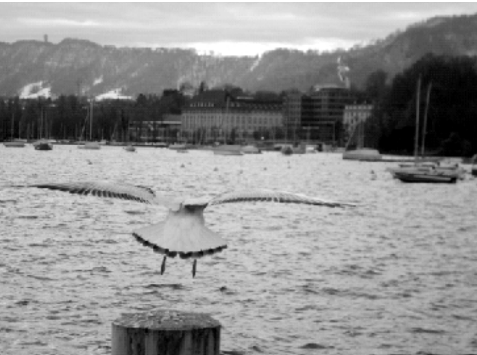
Zurich Lake, as clicked by Snehlata Srivastava, Batch of 1982 (Madhya Pradesh cadre)