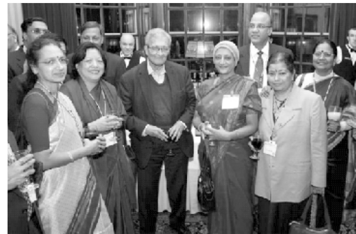
... and interacting with the participants

The tenor of Phase V was set with an address by Nobel Laureate Professor Amartya Sen at the commencement of the Course at HKS. The module at Harvard Kennedy School was designed to give global perspectives on governance and included sessions on the Global Financial Crisis, economic challenges of Globalization, Global Climate Change Policy