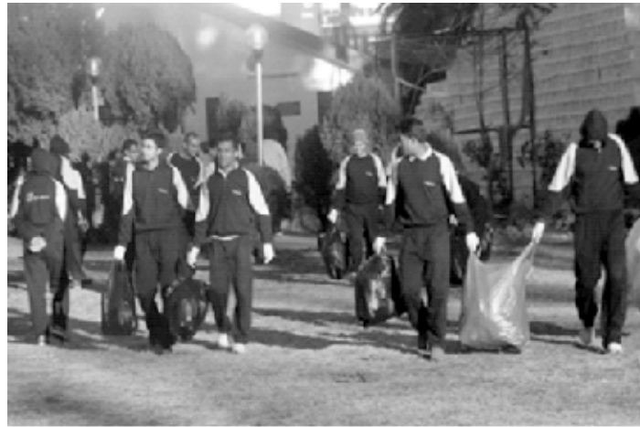
Shramdan: working towards a cleaner environ