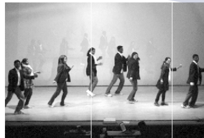
FC OTs bidding adieu to friends...

The OTs of the 85th Foundation Course organized Sham-E-Rukhsat - the moment of departure - a cultural evening on 9 December, followed by a special dinner at the Officer's Mess and a camp-fire. The blues of parting from the Academy and friends from other Services were downed in open-air dancing well into the night. The following day (10 December) saw heavy hearts bidding goodbye to dear friends, as the OTs belonging to the Indian Foreign Service, Indian Forest Service, and Indian Police Service left Mussoorie to resume training at the Institutes of their respective Services. As one of them put it, "One had to say byes to people; you could not even properly say Hi to!"