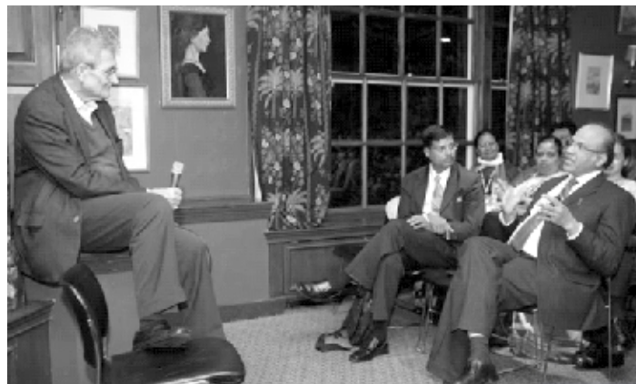
Nobel Laureate Prof. Amartya Sen addressing the Phase V participants at the Harvard Kennedy School...

Phase V: The Phase-V of the Mid Career Training Programme for IAS officers commenced on 12 December, with the initial one week of the Course taking off at the Harvard Kennedy School (HKS). 93 officers from 1979-1983 batches including two officers from the Sri Lankan Administrative Services are participants of this programme. After the opening week at Boston, the programme continued at LBSNAA from 21 December and is on until 14 January 2011.