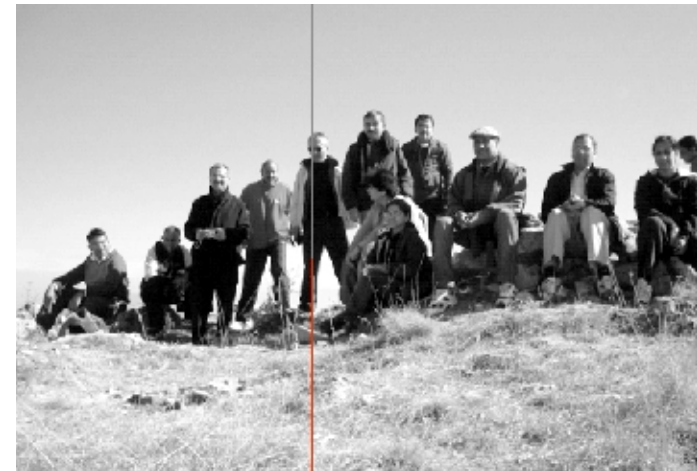
Phase V participants atop the George Everest Peak